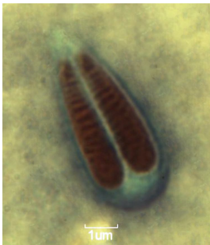
Figure 1: Mature spores of Myxobolus cuttacki from fresh wet mount preparation (bar = 1 \mu\text{m} ).

( 7.05 \pm 1.11 ) \mu\text{m} . The spores were anteriorly elongated and pointed, and oval to spherical. Shell valves were thick, symmetrical and smooth without any parietal folds. Intercapsular processes were absent. Two polar capsules were distinctly equal measuring 6.70-12.30 ( 9.40 \pm 1.56 ) \times 2.00-3.10 ( 2.50 \pm 0.39 ) \mu\text{m} . The nucleus length was 2.50 \mu\text{m} . Capsules were broadly pyriform with pointed anterior and rounded posterior ends. Polar filaments formed 8–11 coils inside the polar capsules and were coiled perpendicularly to the axis of the capsules. The spore length (LS) to spore breadth (BS) ratio was 1:0.43, while the polar capsules length to breadth (LPC and BPC) ratio was 1:0.26. The capsules opened independently. Both polar capsules were situated parallel to each other in the spore cavity (Fig. 1).