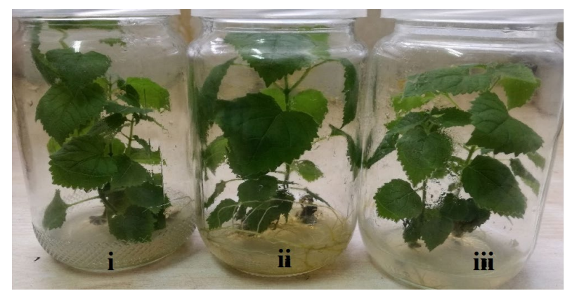
Figure 3: Non-transgenic and transgenic Paulownia tomentosa . i: non-transgenic, ii: transgenic with Thio-60 , iii: transgenic with Thio-63 .

To confirm the transformation of thionin genes into P. tomentosa , PCR for both transgenic species were applied. There were two different bands were detected, about 640 bp for Thio-60 and 480 bp for Thio0-63 . Also, PCR for non-transgenic species was applied to confirm that both thionin genes were not found in them.