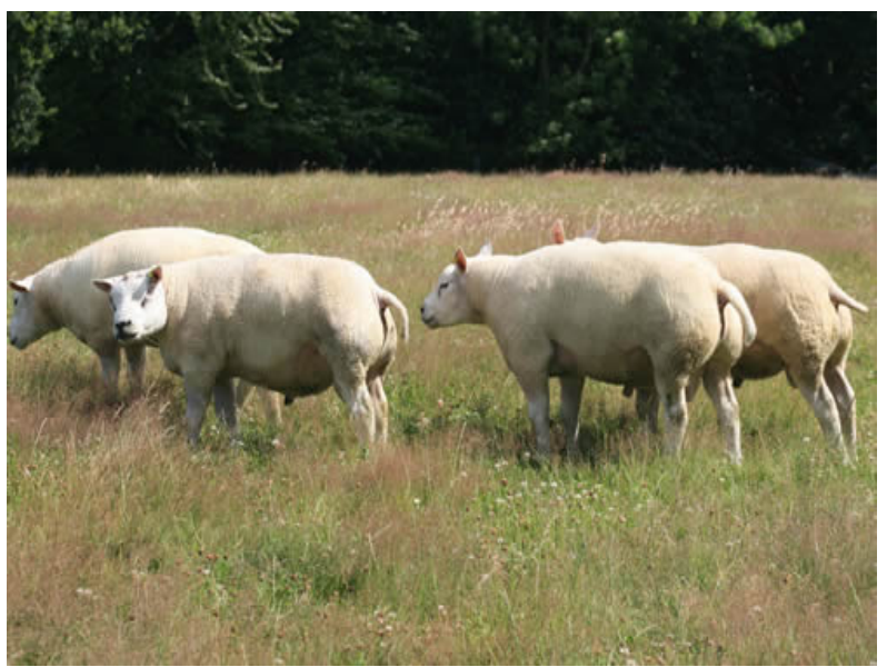
Figure 1: An example of a Texel double muscle sheep

The first description of sheep double muscling was introduced in 1940 [1]. This phenotype occurs frequently in one breed of sheep known as the Texel. Beltex and Texel sheep are famous for their exceptional capacity for meat production [2-4]. The Texel has become the dominant terminal-sire breed in Europe because of its extraordinary meatiness. This double muscling phenotype shows extraordinary muscle growth as shown in Figure 1. Different researchers have used different symbols to differentiate between the double muscled and normal phenotypes. These differences include double muscled or normal, DM or N, D or n, DM or dm, C or N, c or n, A or a, and mh or + [5].