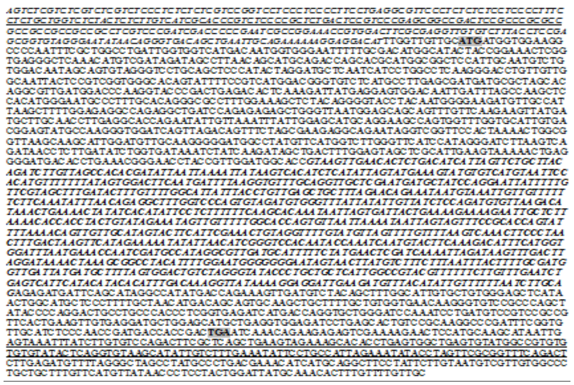
Figure 1: The nucleotide sequence of ZmSTPK1 gene from Zea mays . The gene is 2251 bp in length which expresses a transcript with 1248 bp in length. Start and stop codons are shown in bold and gray and intron region (1003 bp) is shown in bold and italic. 5'-UTR (311 bp) and 3'-UTR (341 bp) are underlined. An upstream open reading frame (uORF) (89 aa), MSSFFLQFSCHPVIFPTPLGGKDTTSRSPRFPAIRG SIGTRRRRRRGRSRPLGTESERGDGCDDKRVETSRGKGRRERERLRKGREDRTRERETRRDET, in upstream of ZmSTPK1 at -12 position from ATG initiation codon is shown in italic and underlined.

The sequence of ZmSTPK1 was analyzed using bioinformatic tools. The results cleared that the maize ZmSTPK1 gene is located on chromosome 10, from position 141015332 to 141017582. The gene was 2251 bp in length with an ORF of 1248 bp encoding 415 amino acid residues and a 5'-UTR of 311 bp and 3'-UTR of 341 bp (Fig. 1). The comparison of the genomic DNA and cDNA sequences (GeneBank accession No. EU964756.1) revealed that this gene includes only one intron (1003 bp) which separates two exons (Fig. 1). The sequences of the intron/exon splice junctions follow the GT-AG rule [28].